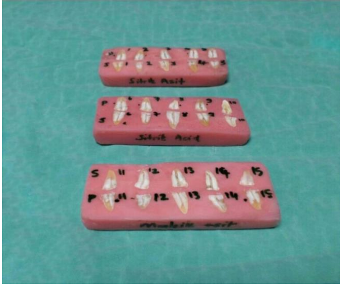
Figure 1. Prepared samples.