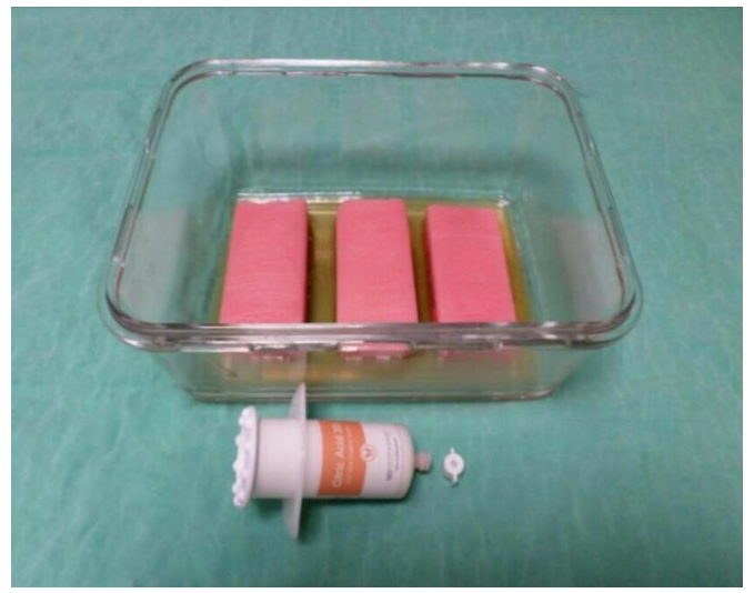
Figure 2. Chelation with 20% SA

For group M1, JE (i-EDTA, Medicinos Linja UAB, Lithuania), for group M2, LE (Prime Dental Products, PVT, Ltd., India), for group M3, CA (Ultradent Products, Inc., South Jordan), for group M4, MA (Dicle University Faculty of Medicine, Diyarbakir, Turkey) was applied for 120 seconds. The samples were immersed by facing down in a bowl, and the sample sides of the blocks