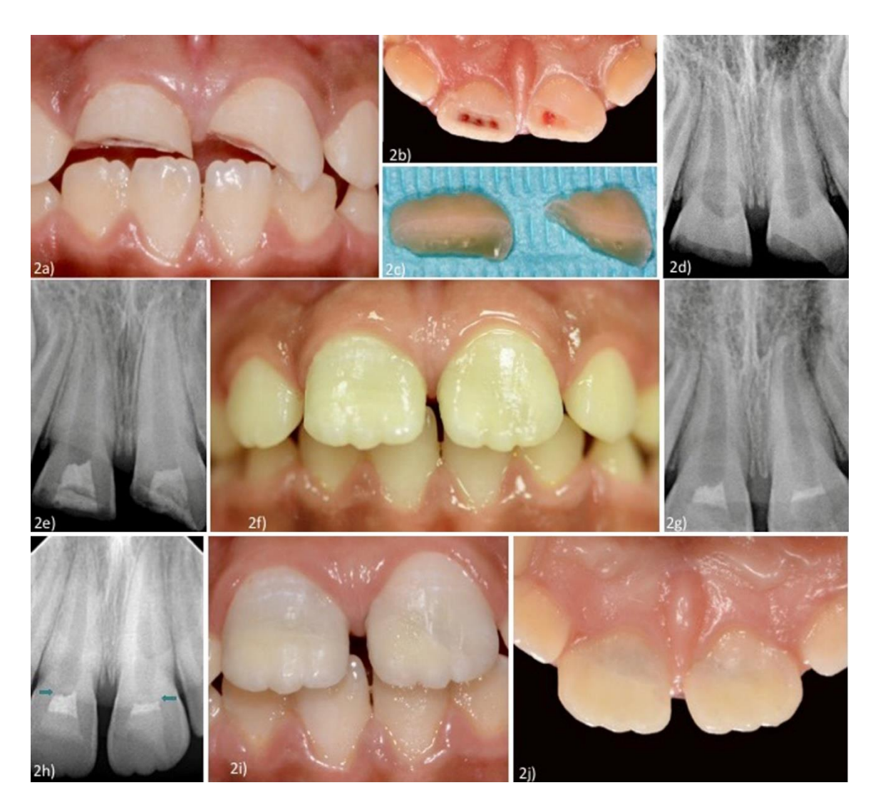
Figure 2. a) Clinical view (Buccal) of the fractured maxillary incisors. b) Clinical view (incisal) showing the exposed pulp horns of the maxillary incisors. c) A photograph showing the broken segments. d) Preoperative periapical radiographic view. e) MTA was applied directly onto the pulp. f) Cementation of the broken segments using resin composite. g) 3-month follow up periapical radiographic view. h) 12-month follow up periapical radiographic view showing continued root formation & hard tissue barrier formation. i) and j) Follow up after 12 months.

An 8-year-old female patient was referred with a complaint of a fractured maxillary right and left central incisor teeth (# 11 and 21). Medical history was non-contributory. Clinical examination revealed a complicated fracture involving enamel, dentin and the pulp. Clinical examination showed no pain on palpation and no tenderness to percussion (Fig. 2a, b). The parents kept the broken segment in water for about 10 hours (Fig. 2c). Periapical radiographic examination showed no evidence for alveolar or root fracture. The roots of both teeth were immature (Fig. 2d).