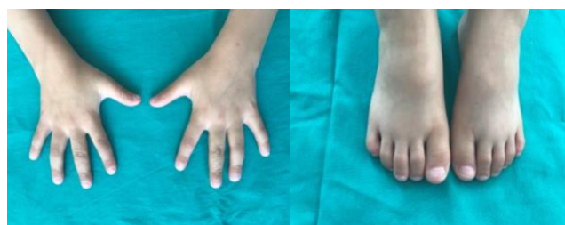
Figure 5. Appearance of thinning and fractures in the fingernails and toenails of the patient