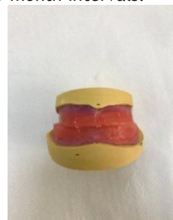
Figure 10. Plaster and wax models after taking vertical dimension measurements