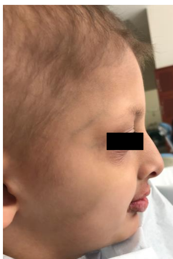
Figure 2. Lateral appearance of the patient, weak hair