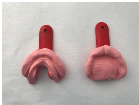
Figure 9. Preliminary impressions of the patient were taken with irreversible hidrocolloid