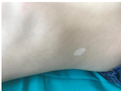
Figure 7. Appearance of scaling and spotting on the skin

An intraoral examination revealed anodontia; there were no teeth on the maxilla or the mandible, and there was no radiographically identified tooth germ. Furthermore, the patient suffered from dry mouth due to insufficient saliva production (Figs. 7, 8). The patient and his legal guardian were informed about the treatment options and their potential complications. Permission was received from the patient and his legal guardian for all procedures to be carried out, and they signed an informed consent document. Because the growth and development of the 5-year-old patient were ongoing, it was decided to apply a total prosthesis of the mandible and maxilla. Preliminary impressions were taken from the mandible and maxilla using irreversible hidrocolloid impression material (Kromopan; Lascod, Firenze, Italy) (Fig. 9).