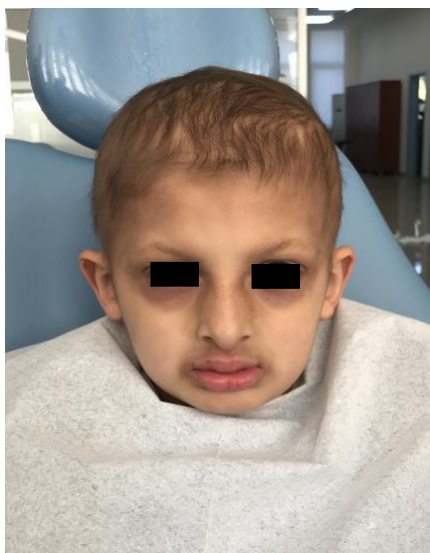
Figure 1. Frontal appearance of the patient