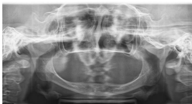
Figure 8. Panoramic radiograph of the patient