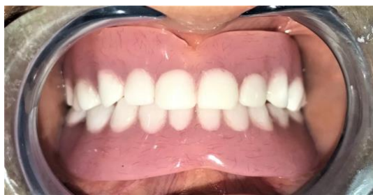
Figure 11. Completed appearance of the total prosthesis of the patient