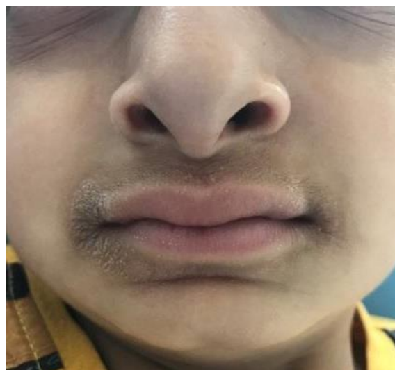
Figure 4. Think wrinkles found around the lips and eyes of the patient, appearance of saddle-shaped nose