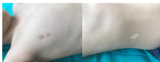
Figure 6. a. Double-nipple appearance in the patient. b. Appearance of scaling and spotting on the skin