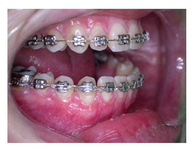
Figure 3. Postoperative occlusion

During surgery, osteotomies were performed and the maxilla was slightly mobilized after downfracture. The distractors were placed intraorally on both sides of the maxilla. One week after the operation, we started to distract the maxilla (0.5 mm, twice daily). On the sixth day of distraction (5 mm total movement), we noticed the loosening of the right distraction rod. A careful examination of the rod revealed that it had broken. (Fig. 2). The manufacturer was informed of the failure immediately, because we decided initially to replace