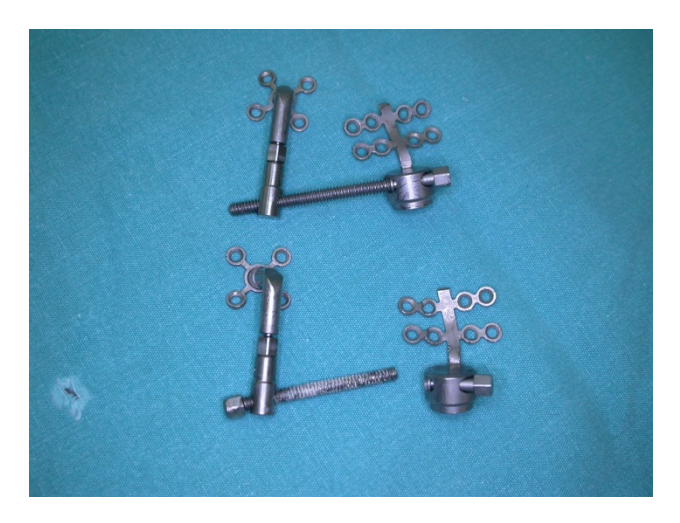
Figure 2 . Photograph of the distraction devices

the device as soon as possible. After further evaluation of the situation, we decided that it would be better to use a conventional method to avoid the interruption of the distraction period. Thus, the distractors were removed and the patient was treated using conventional osteotomy techniques to achieve good occlusion and improve the facial profile (Fig. 3).